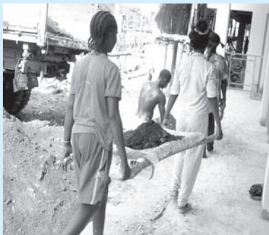
Picture 8.2. Working for self-reliance