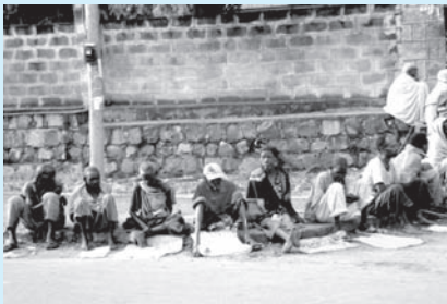
Picture 8.1. People depending on aid