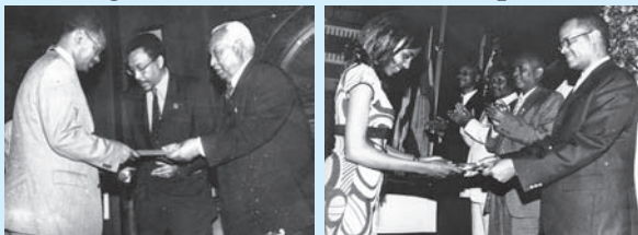
Picture 8.4. People awarded for their exceptional performance